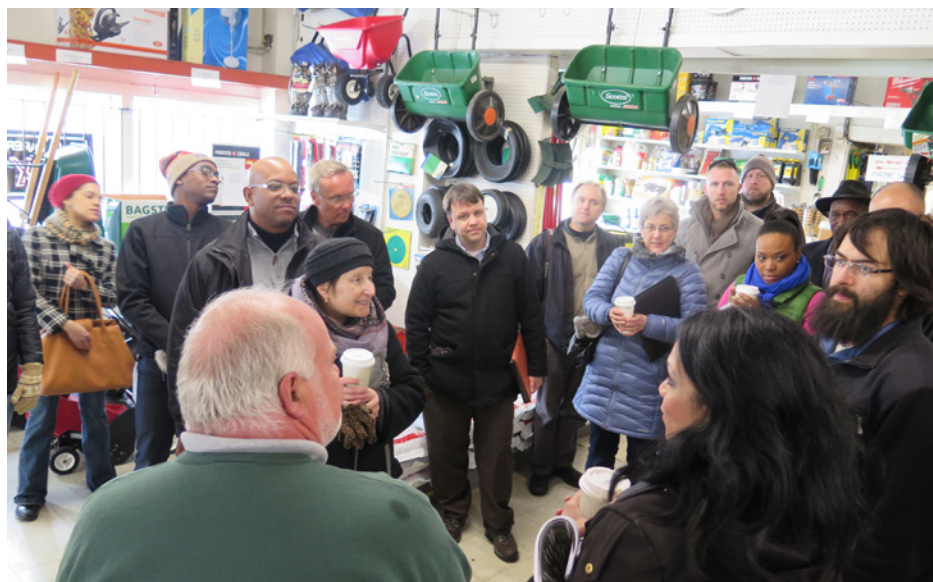
Members of the project implementation committee and consultant team

The initial stages of the planning process recognize the importance of reinforcing existing community-based plans, projects, and initiatives in the project area and the desire to advance a corridor-wide approach that builds on the success of prior work. Accordingly, Phase 2 of the project involves a detailed inventory and assessment. The inventory and assessment phase provides the factual and analytical basis for the remainder of the community development, planning, and design effort. Sources for the inventory include GIS, existing maps, property records, plans and studies; input from the broader community in prior engagement efforts; additional community input consistent with the initiatives outlined in the Community Engagement Plan; and input from the Project Implementation Committee.