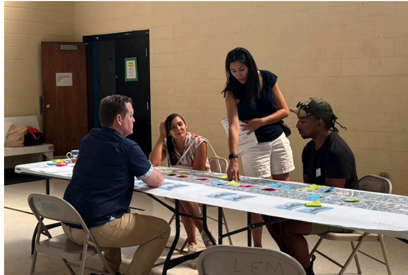
Participants share feedback at Little Earth office hours