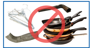
Random metal items