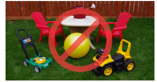
Large plastic items and toys