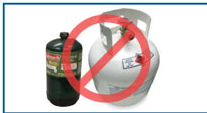
Pressurized cylinders (propane, helium, CO2)