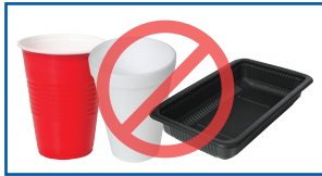
#6 and black plastics