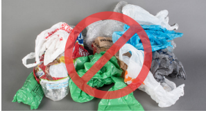
Plastic bags and film

The following items cause problems in the recycling process because they get tangled in equipment, can harm workers, and have no good end markets to make them into new materials. Keep them out of your recycling. Learn more at hennepin.us/recycling