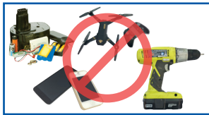
Electronics and batteries