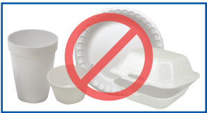
Plastic foam (Styrofoam™)