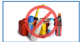
Containers that held hazardous products

Find disposal options for these items and many more on the Green Disposal Guide at hennepin.us/green-disposal-guide