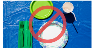
Paper plates, cups, napkins, straws, and utensils