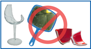
Glass dishes, window glass, and ceramics