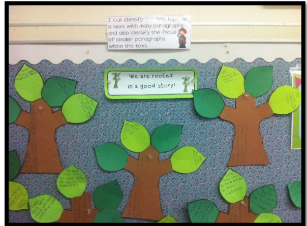
Answer each question on a tree leaf.