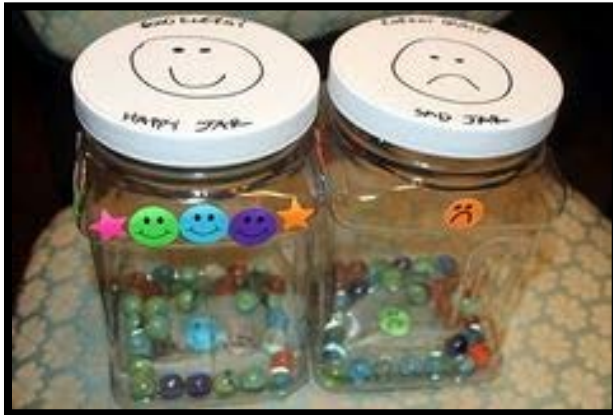
Give each person one marble for each question.

Try something new! Here are some ideas that might help you design a more visual and interactive survey or outcomes tracking process.