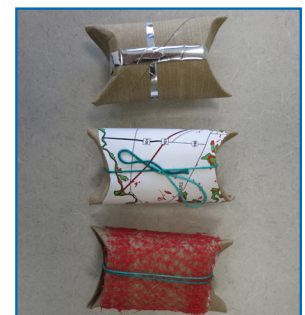
Completed decorated gift card holders.