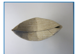
Fold the other half of the toilet paper roll to enclose it.