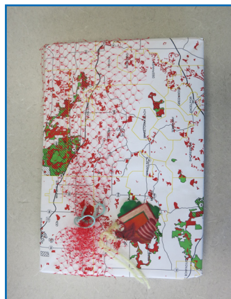
Example of green gift box made from a box.