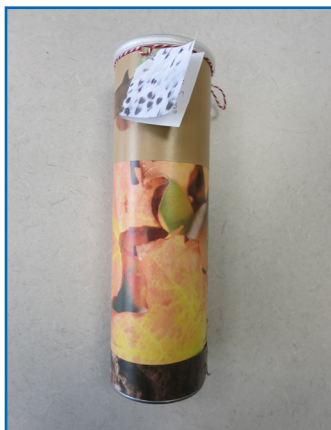
Example of green gift box made from a Pringles container.