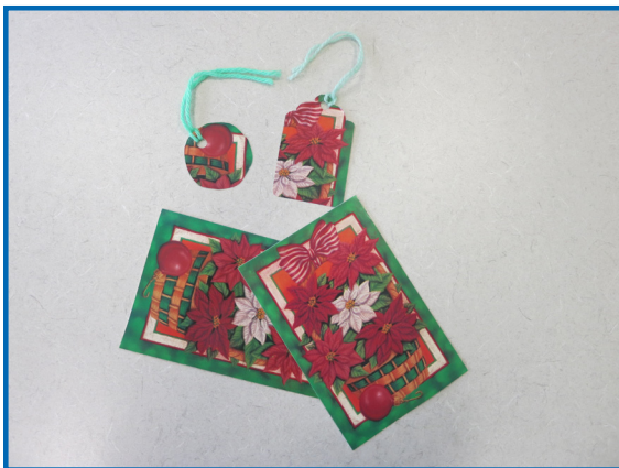
Examples of gift tags made from repurposed greeting cards.