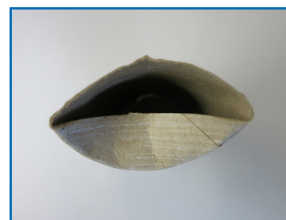
Start by folding one half of the toilet paper roll at both ends.