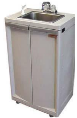
B. Gravity Hand Washing Sink